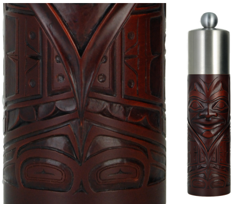
Native Chief Salt or Pepper Mills by BOMA